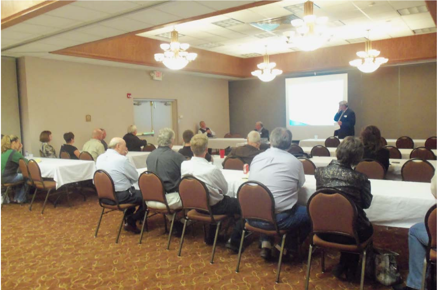
Attendees at the Sioux City Flood Forum

volunteers for putting together this insightful seminar. Special thank you to the three presenters for donating their time and knowledge for this event.